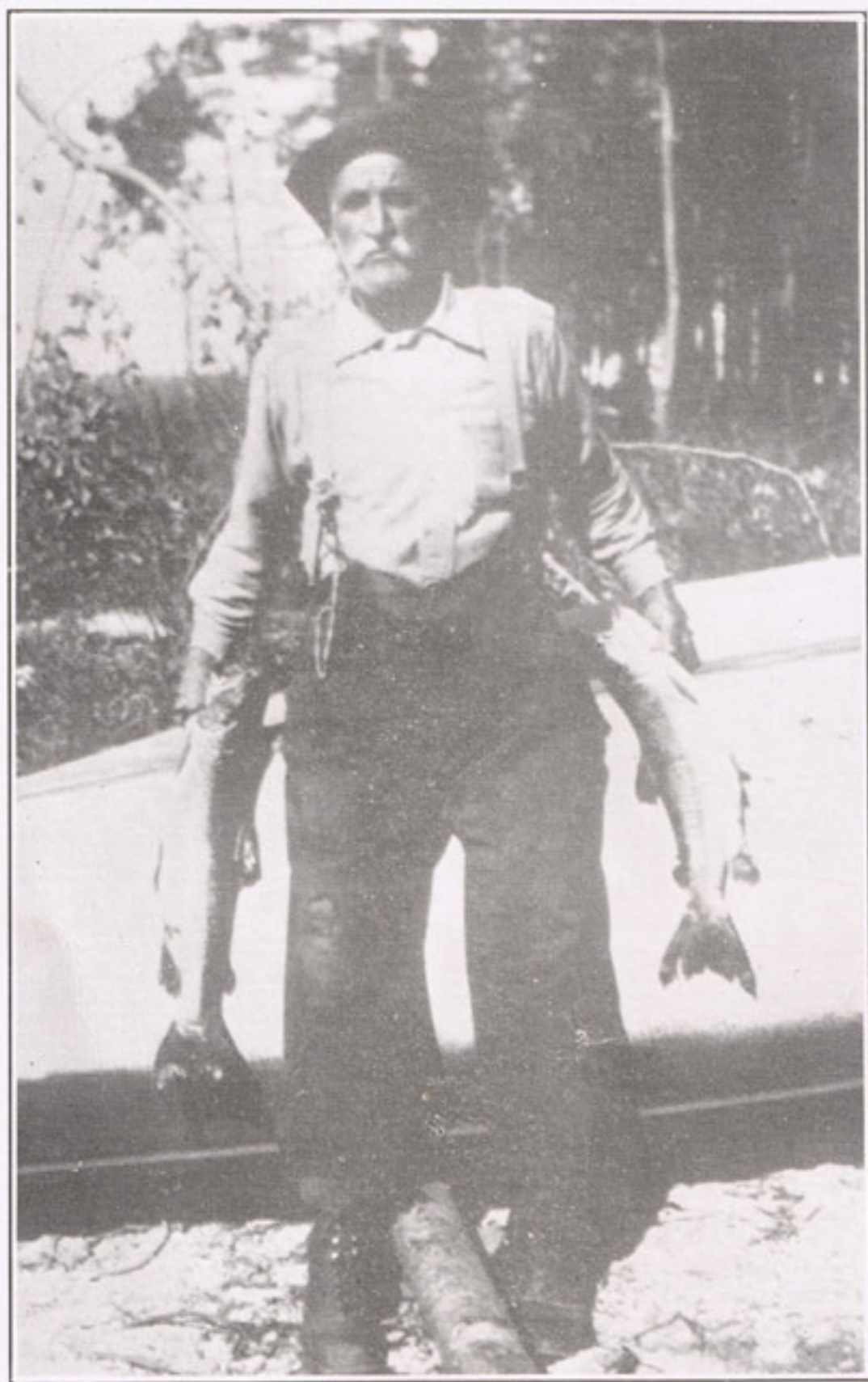
Ye Olde Maine Guide

As the air clears and becomes snappy, and the leaves put on their gorgeous autumn colors, then the call of the trail comes to every hunter. This call must be answered, so he packs his duffle bag and begins his annual pilgrimage to the woods. In this section the early bird hunting is excellent and then when the big game season opens one can be sure of his share of the spoils.